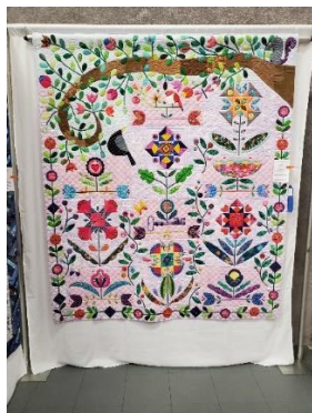
Best of Show - Sue Edwards