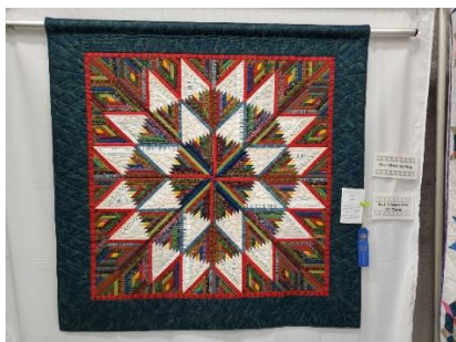
Best Hand Quilting & Best Interpretation of Theme - Lynn Lentz